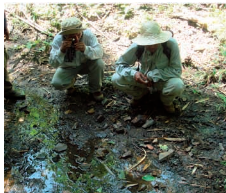
Brighton Mining is exploring in Cambodia

The focus in Cambodia, the least developed mining sector of Indochina, has been gold exploration with Australian companies Indochine Mining Ltd and Oz Minerals Ltd leading the way.