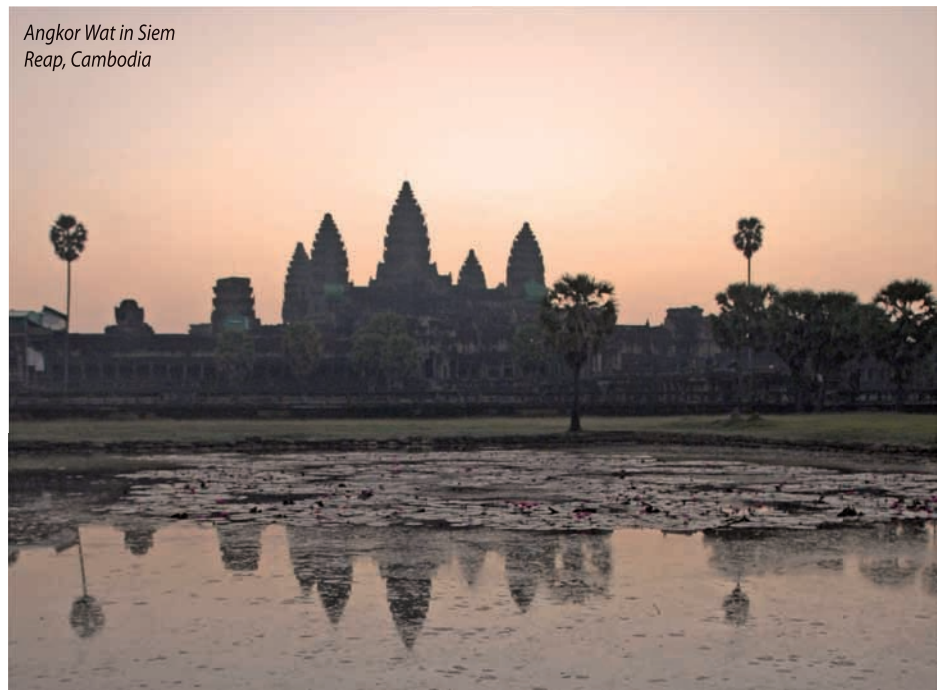
Angkor Wat in Siem Reap, Cambodia

Last year, Thailand's Democrat Party-led coalition